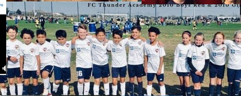
FC Thunder Academy 2010 Boys Red & 2010 Girls