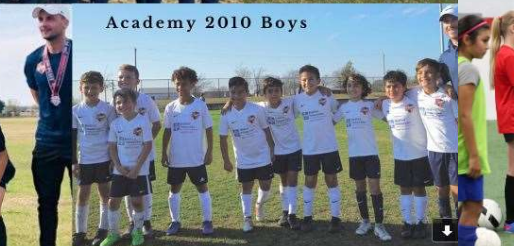
Academy 2010 Boys