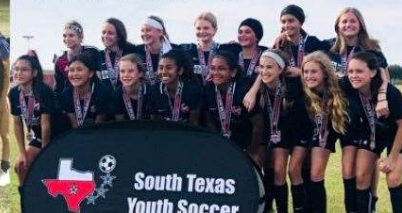
South Texas Youth Soccer