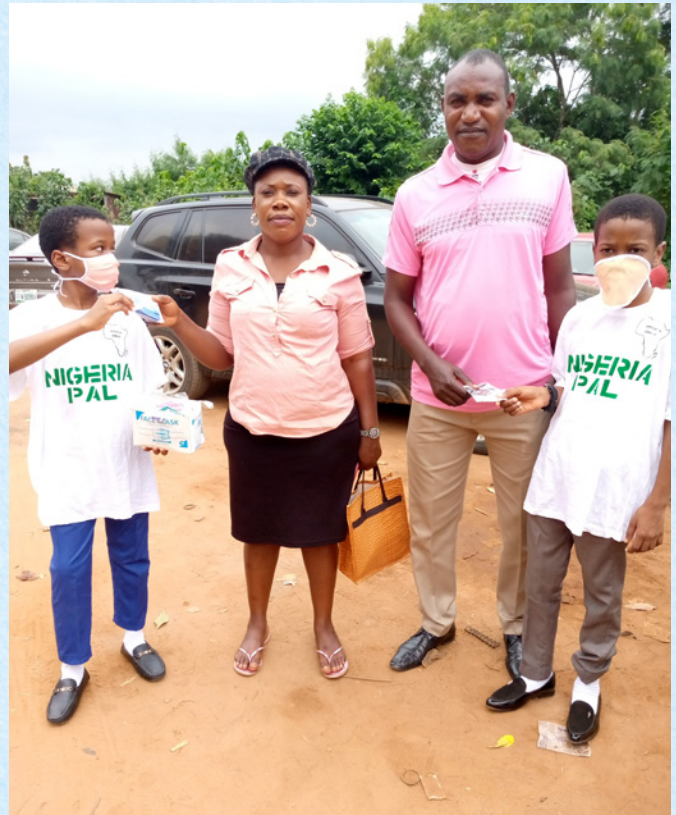
Nigeria PAL youth hand out face masks to members of the community and provide tips on how to stay safe during the global COVID-19 pandemic.

Nigeria PAL also organizes sporting events and competitions among youth, as well as helping the community develop sanitation programs and visitation to orphanage homes as means of showing commitment to community service and helping others.