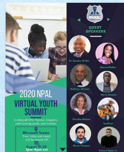
2020 NPAL Virtual Youth Summit

With the success of past Youth Mentoring and Leadership Summits, we knew there was great anticipation for the 2020 Summit, but realized that with keeping the health and safety of our Chapters in mind, an in-person event was not in the best interest for all. Despite facing some challenges, we were still able to bring together hundreds of youth and adults from across the country and the Virgin Islands to host our first ever Virtual Youth Summit from August 18 th through August 20 th .