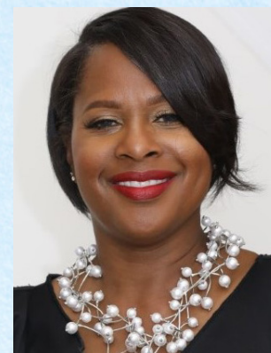
Joan Higginbotham, National Ambassador for STEM

National PAL is thrilled to officially announce Mrs. Joan Higginbotham as the National Ambassador for STEM. An electrical engineer and retired NASA astronaut, Higginbotham is the third of only three African American women to go into space. At an early age, Higginbotham fell in love with science and math and while matriculating to high school, was introduced to INROADS, a program which exposes women and minorities to the field of engineering. Because of her participation in this program, Higginbotham decided to pursue engineering in college, making the most of her love for science and math.