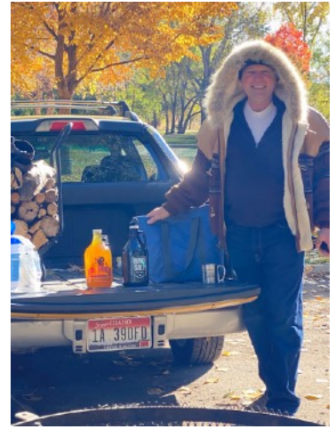
Tailgate gathering at Kristin Armstrong Park.