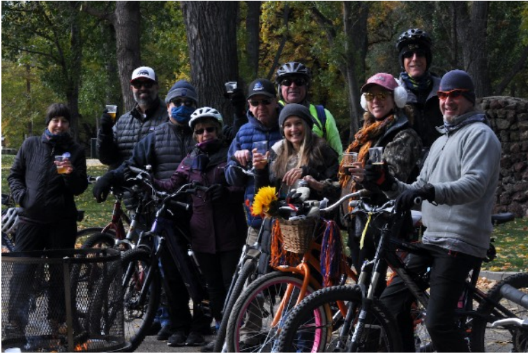
Our riding group of eleven (ten plus the photographer).

The day for the first Greenbelt Bike Brewery Tour was a bit chilly with temps just above freezing, but bright blue skies. There was a warm fire with beer tastings from the Ram served off the tailgate to greet everyone at Kristin Armstrong Park, the beginning of our seven mile loop.