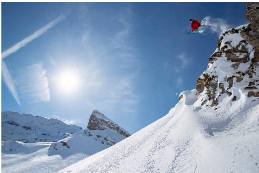
Lexi DuPont, who began skiing at age 2 in Sun Valley, was on the cover shot of “Future Retro” (left) and is catching big-air in the mountains surrounding Interlaken, Switzerland (above).