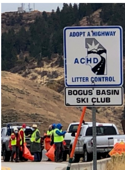
Getting all organized at the Forest Service sign.