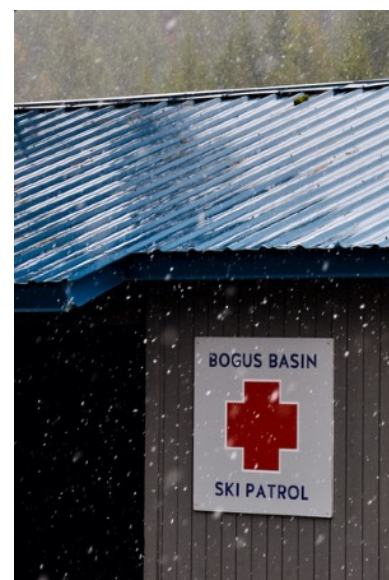
First flakes of the year.

We did things a little different this time in that everyone wore masks to be transported up the mountain to their drop off mile. From there on it was pretty much picking up trash as usual. Some unusual things were found along the way including a hash pipe and a computer of all things. We accumulated a fair size pile of trash that we left by the Forest Service sign for ACHD to pick up and dispose.