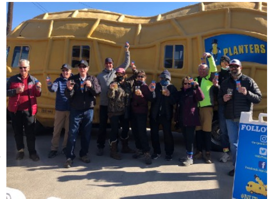
Mr. Peanut Truck at Lost Grove Brewery.

There were eleven lucky people who participated. Our first stop was Lost Grove Brewery where we were greeted by the Mr. Peanut Truck with free peanuts and a bonfire outside.