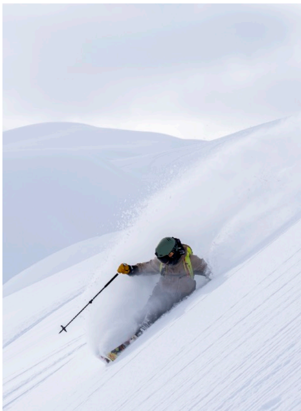
Tanner Rainville (right) , a native of Vermont, skies deep powder in Alaska.