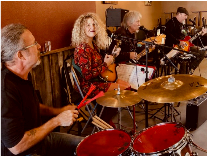
The Nocturnals performing at White Dog Brewing Co.

Next we rode up to Ester Simplot Waterpark, then crossed over the bridge to Payette Brewery where we were greeted with more sunshine and a great selection of brew from which to chose.