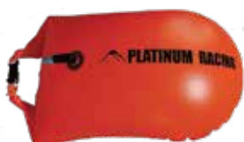
Swim Practice Buoy