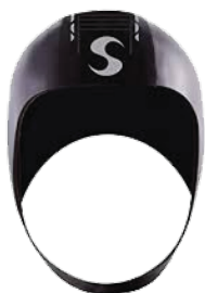
Neoprene Swim Cap