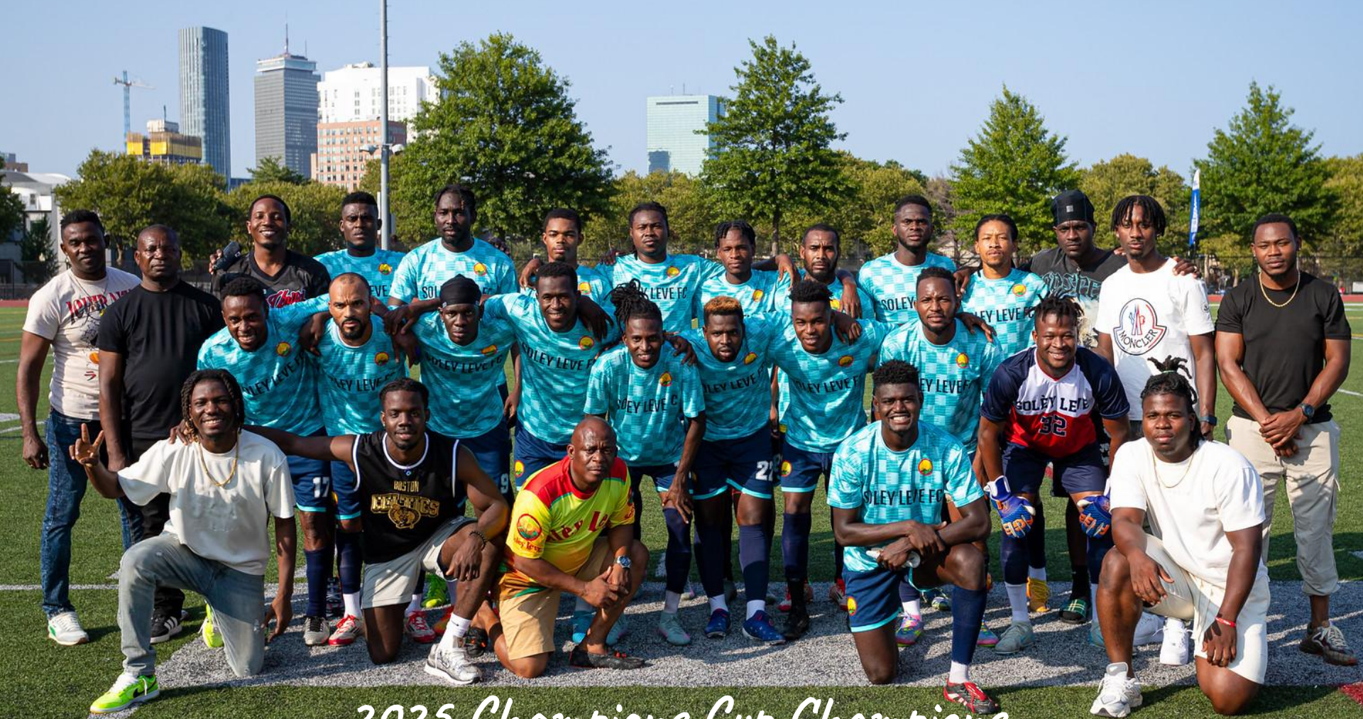
2025 Champions Cup Champions