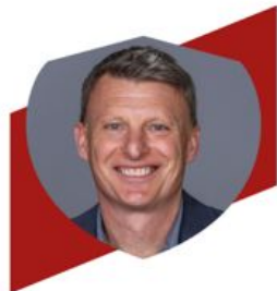
MATT CROCKER SPORTING DIRECTOR - U.S. SOCCER