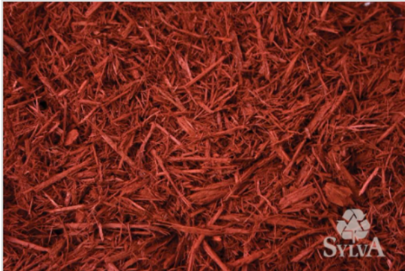
Red Canyon Shredded

ALL BAGS ARE $7 EACH WITH A 10 BAG MINIMUM ORDER FOR DELIVERY