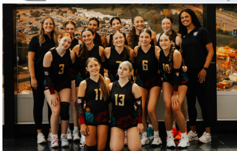
ARIZONA REGION HIGH PERFORMANCE GIRLS U15