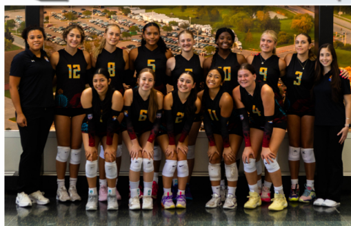
ARIZONA REGION HIGH PERFORMANCE GIRLS U17