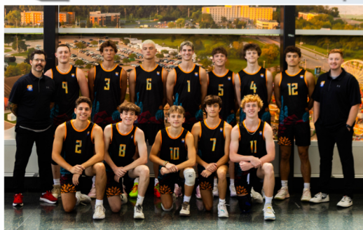
ARIZONA REGION HIGH PERFORMANCE BOYS U19