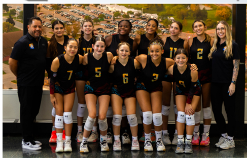
ARIZONA REGION HIGH PERFORMANCE GIRLS U13