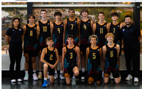
ARIZONA REGION HIGH PERFORMANCE BOYS U15