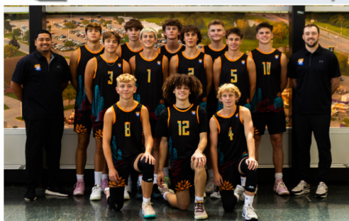
ARIZONA REGION HIGH PERFORMANCE BOYS U17