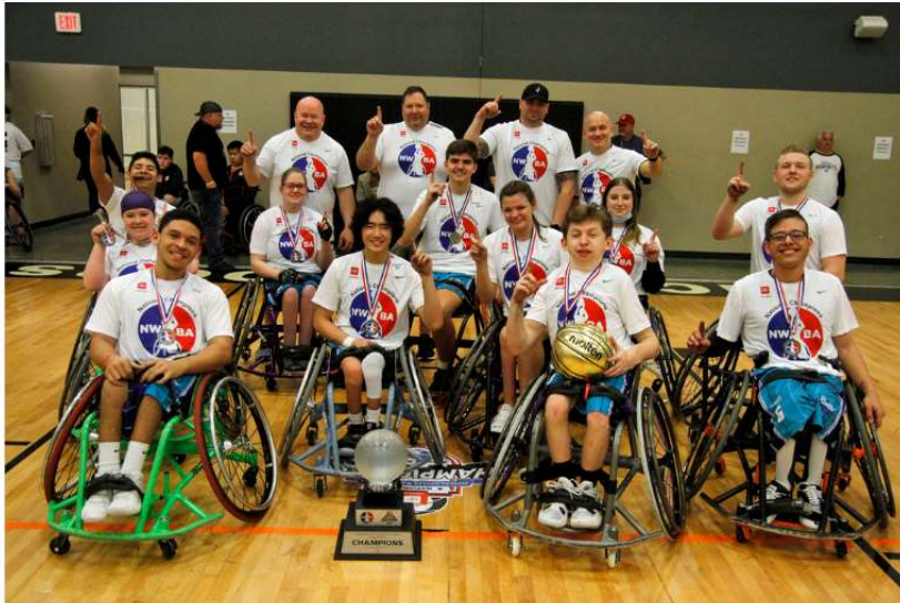
National Champions Charlotte Rollin' Hornets Varsity National Champions