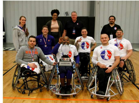
National Champions New York Rollin' Knicks DI National Champions