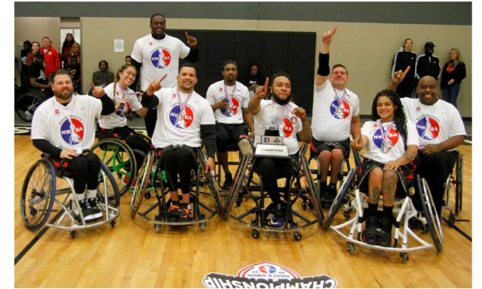
National Champions Memorial Rehabilitation Sharks DIII National Champions