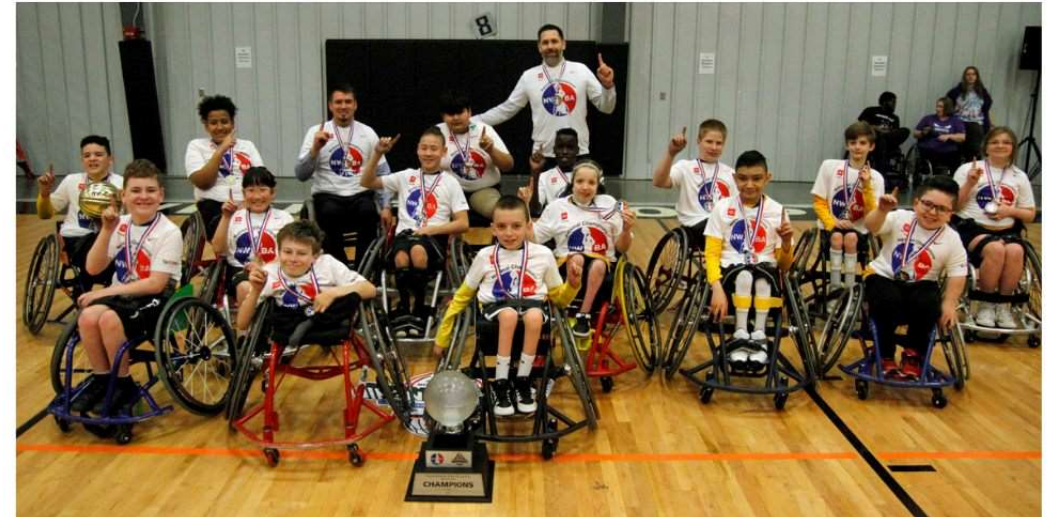
National Champions Kansas City Kings Prep National Champions