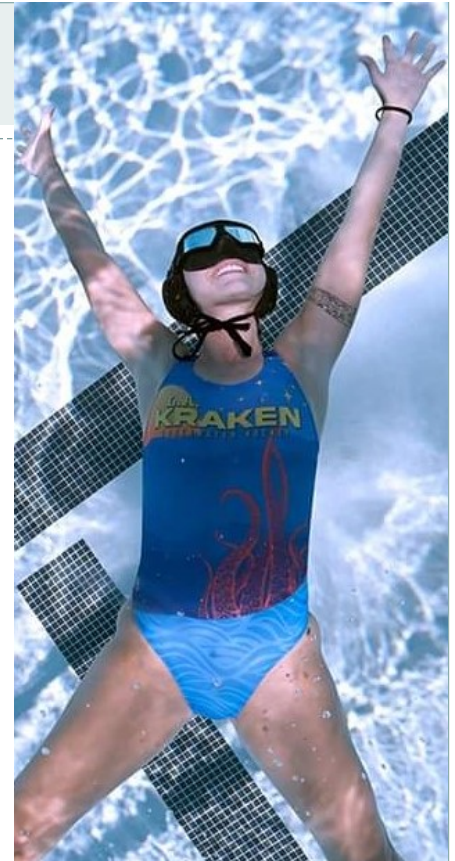
PCCs 2022

Worlds 2023 will be held in Gold Coast, Australia July 18-30. The US will be sending four teams: Men's Elite, Women's Elite, Men's Masters, and Women's Masters. The most recent report is that there will be approximately 47 teams in attendance. For more information about the tournament, visit the event website here .