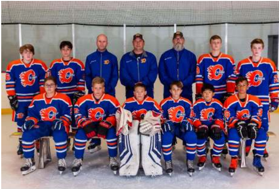
12U-Eckart Record: 24-21-2