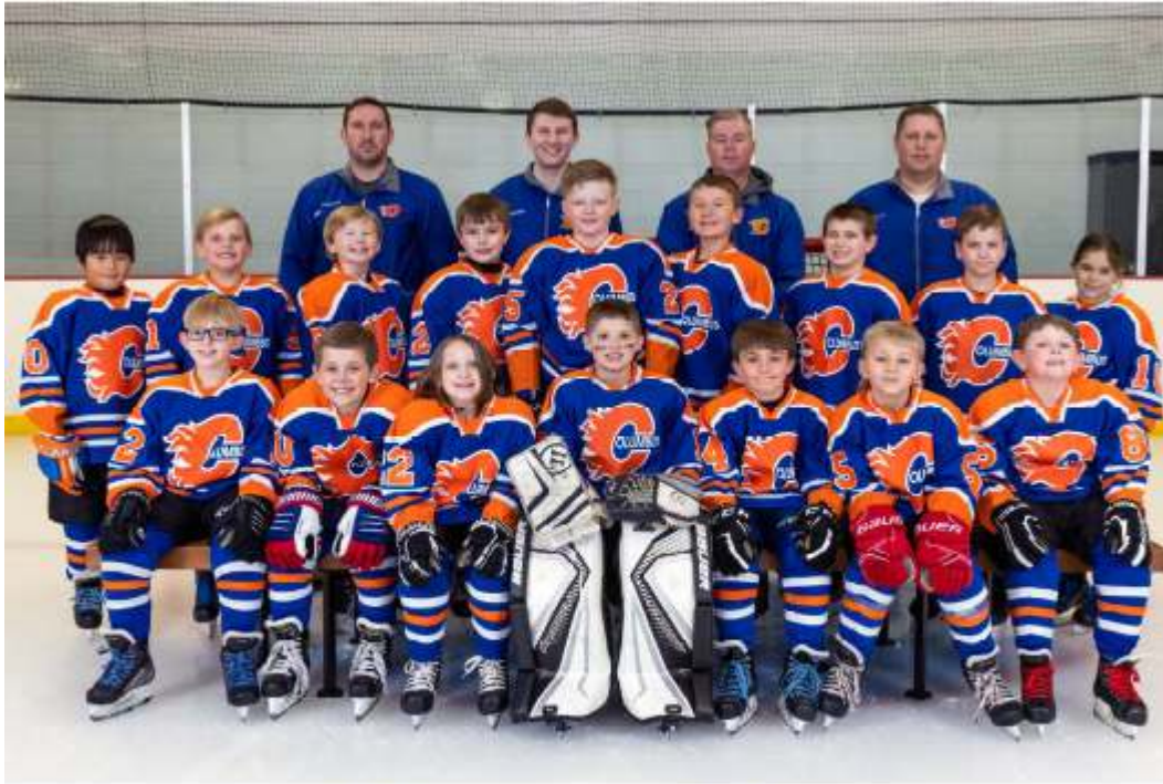
8U-Blue Record: 29-13-2