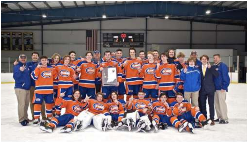
Icemen-Coy Record: 20-16-2 ISHSHA 2A State Champions