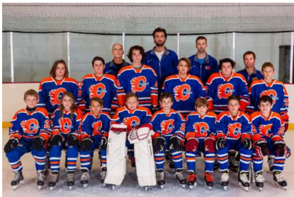
12U-Kelley Record: 8-29-1