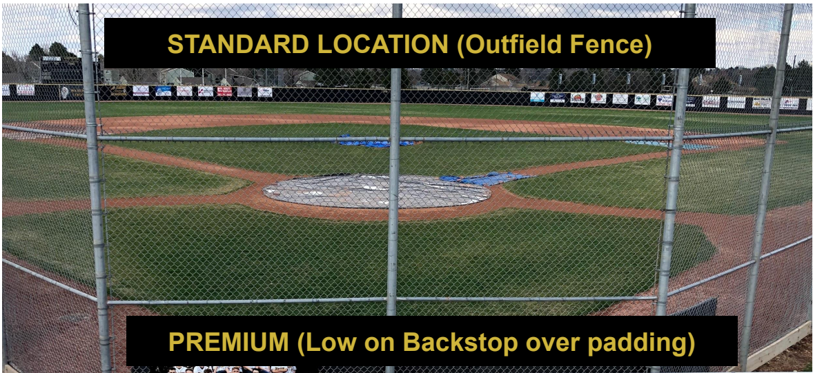
STANDARD LOCATION (Outfield Fence)