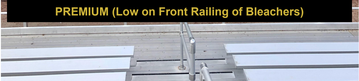
PREMIUM (Low on Front Railing of Bleachers)