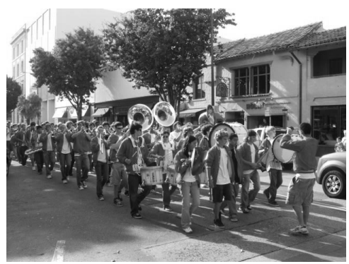
This photo was taken at last year's event.

The Burlingame High School Music Boosters invite all alumni to attend the 19th annual Play-a-thon fundraiser. Stop by the Burlingame Train Station on Saturday, Oct. 25, 2008, between 9 a.m. and 5 p.m. for a very special day of community fundraising for the BHS music department. The BHS bands and choirs will present music throughout the day. There will also be an on-site bake sale, barbecue and an opportunity to direct the band. You can participate in a raffle that features prizes donated by Burlingame merchants. The band traditionally marches down Burlingame Avenue at 11 a.m. and again at 3 p.m.. It is a very exciting and memorable day for all participants! We hope to see you there to share in the fun!