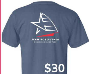
BLUE JEAN KIDS COTTON SHORT SLEEVE SHIRTS (YOUTH S-L)