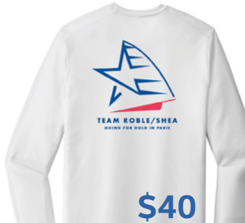
WHITE ADULT & YOUTH LONG SLEEVE SHIRTS (YOUTH: M-L, ADULT: M, L, XXL)