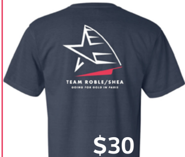
NAVY ADULT SHORT SLEEVE COTTON SHIRTS (S-XXL)