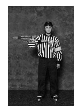
Delaying The Game