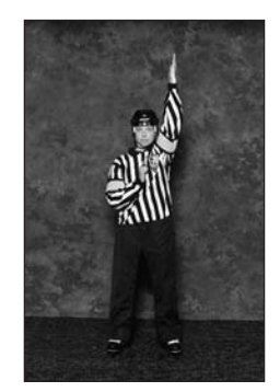
Delayed Calling Of Penalty