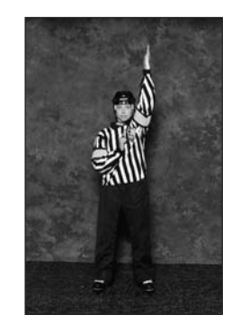
Delayed (Slow) Whistle