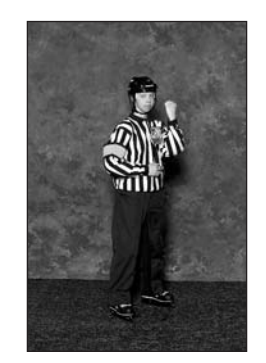
Holding The Facemask