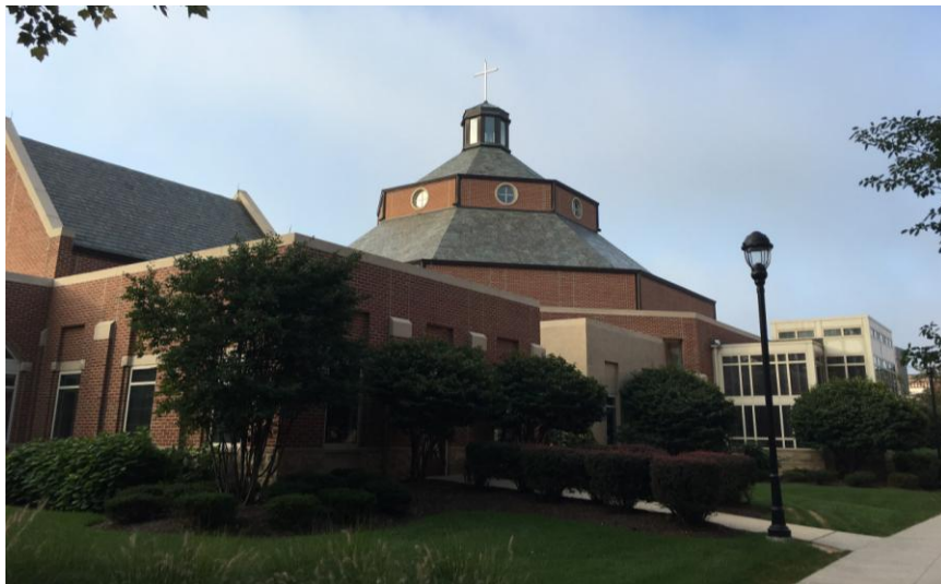
St. Mary of the Assumption Chapel

Years in passing cannot sever Ties of new days from the old. We're Ignatius men forever As we hail the blue and gold.