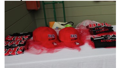
Tee shirts and Red Baseball Hats

To place your order, go to the site above. Please look at the approximate measurements to determine size. All items are unisex. There is a slight variation between brands and it seems the t-shirts run a little small. The qualities of the shirts are very good. We hope to see you wearing your BHS Alumni apparel at the next BHS event.