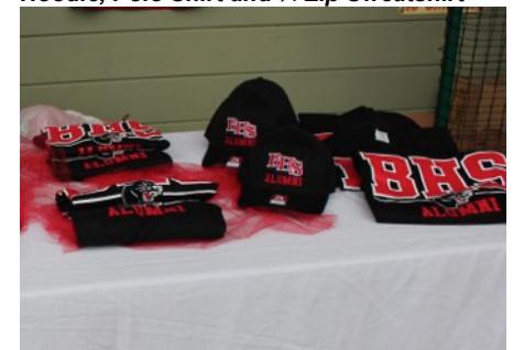
Different Tee Shirts, Black baseball Hats. Show your Panther Pride