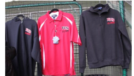
Hoodie, Polo Shirt and ¼ Zip Sweatshirt