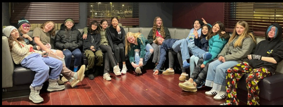
NS 14T2 Minneapolis, MN | ONE Hockey Tournament 2 nd Place