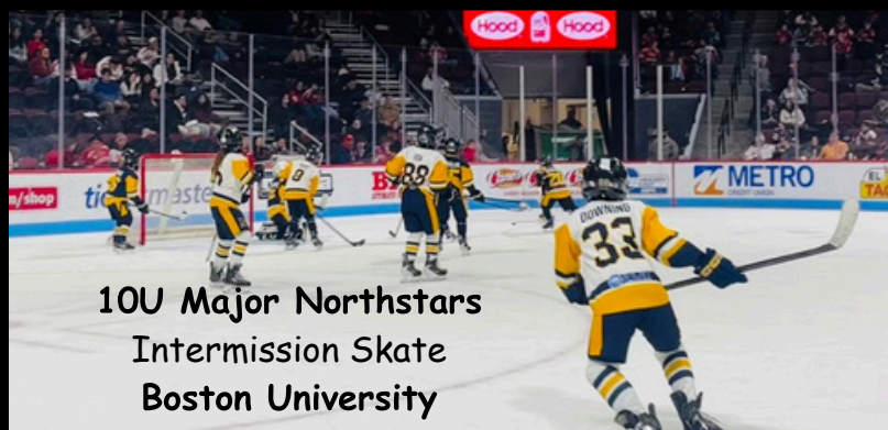
10U Major Northstars Intermission Skate Boston University