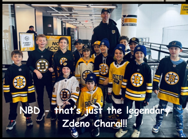
NBD - that's just the legendary Zdeno Chara!!!