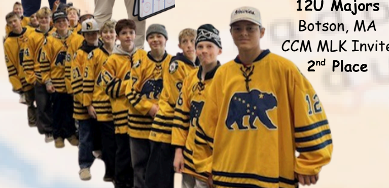
12U Majors Botson, MA CCM MLK Invite 2 nd Place

These trips take a massive amount of coordination, patience, planning and resources for our families and for our organization.