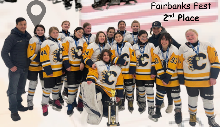
12U Comet Girls Fairbanks, AK Fairbanks Fest 2 nd Place

Nothing like seeing a Bruins game from a Private Suite! YOLO!