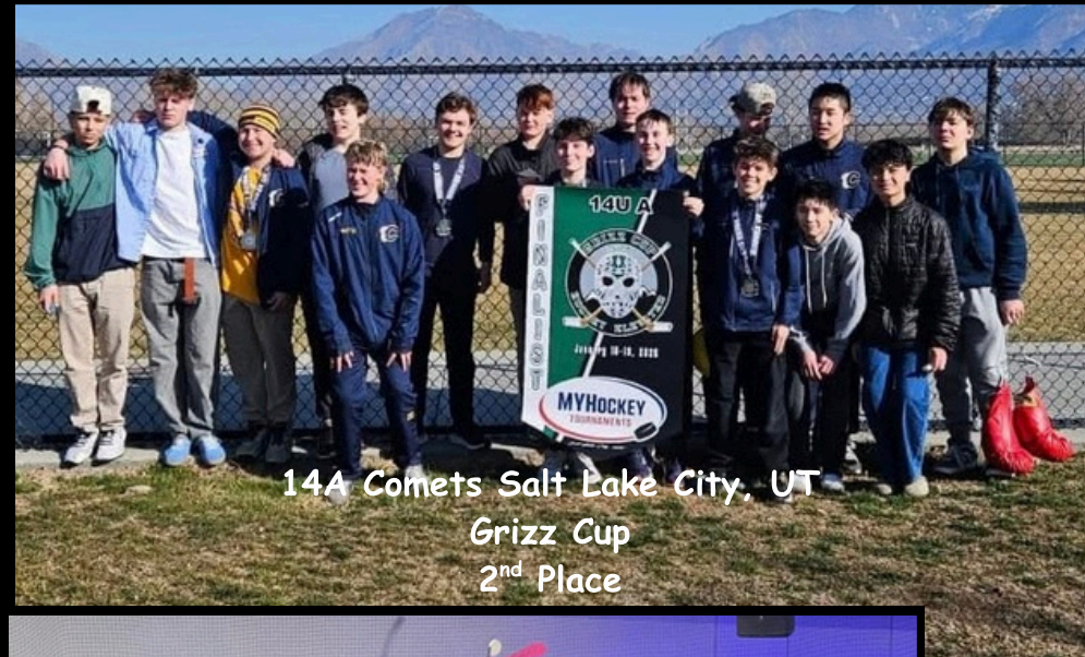
14A Comets Salt Lake City, UT Grizz Cup 2 nd Place