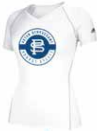
White Women's Athletic Short Sleeve Tee $25