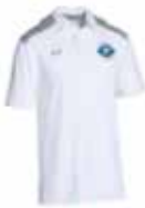
White Polo Shirt $25