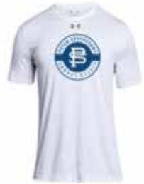
White Men's Athletic Short Sleeve Tee $25