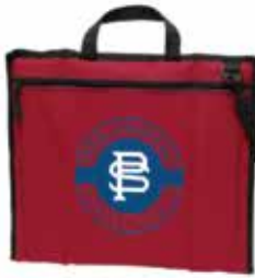
Red & Black Duffel Bag $35