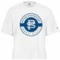
White Men's Athletic Short Sleeve Tee $25