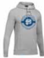
Grey Hoodie $35