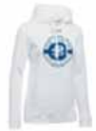
White Hoodie $35

Top Quality Brands • Wide Variety of Items • Reasonable Prices