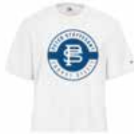
White Men's Athletic Short Sleeve Tee $25