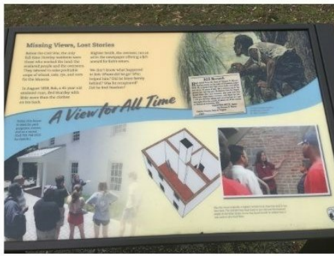
Wayside Historical Marker