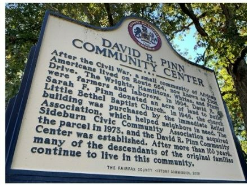
History Commission Marker