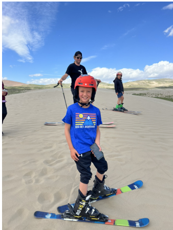
Skiing the sand dunes enroute to the Sierras.