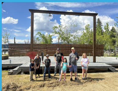
Ponderosa Center clean-up