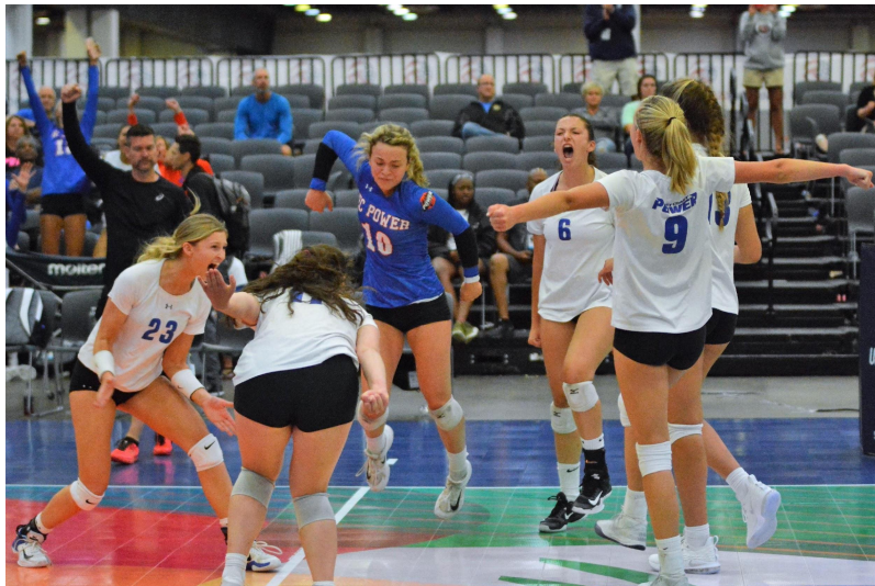
17 Steel 3 rd at Nationals