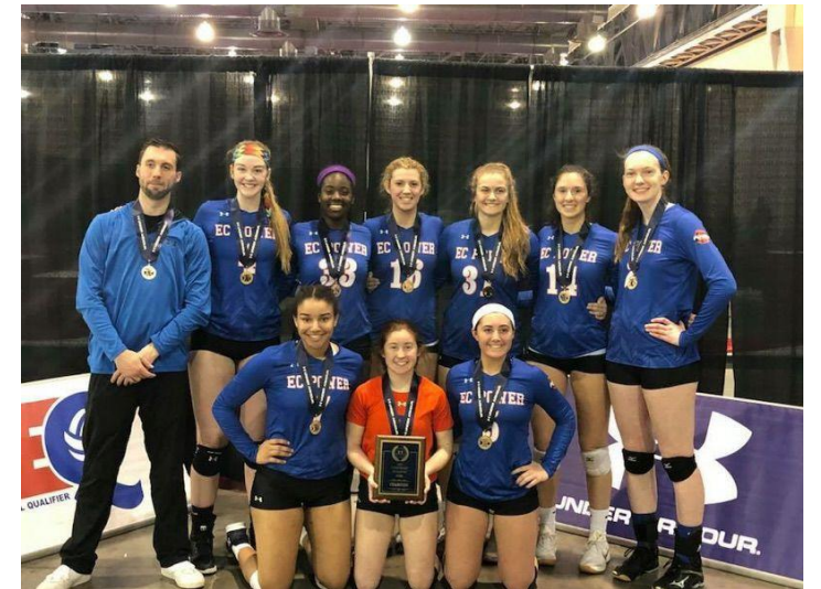
18 Royal- Gold in USA division at NEQ, Bid earned at Boston Qualifier