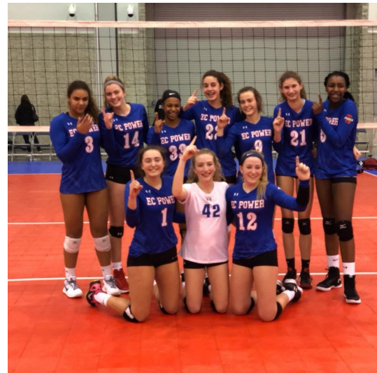
15 True win MAPL VA