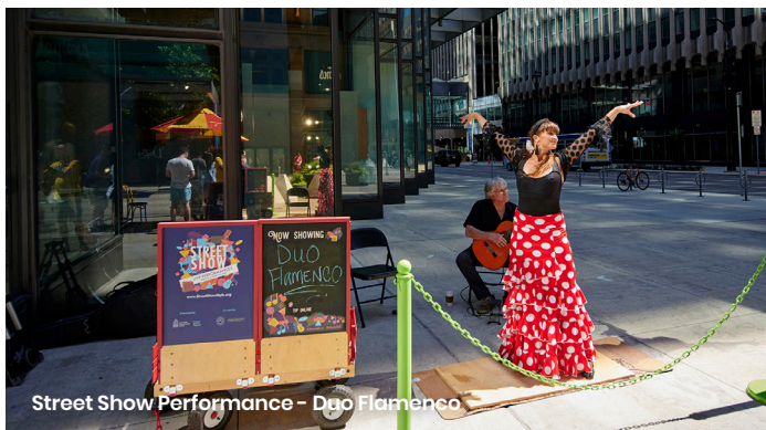
Street Show Performance - Duo Flamenco