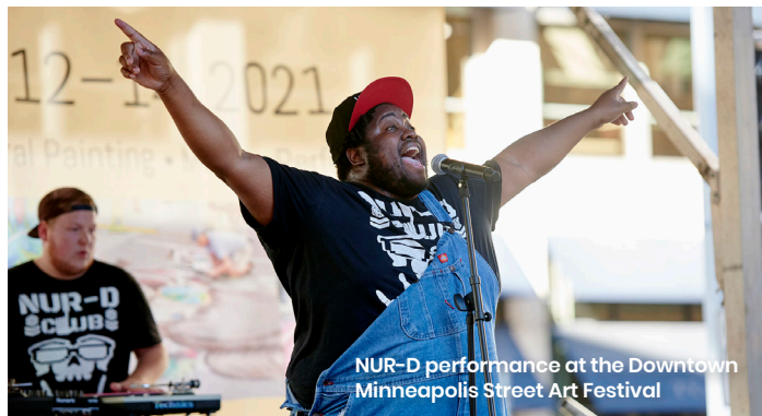
NUR-D performance at the Downtown Minneapolis Street Art Festival

The Downtown Minneapolis Street Art Festival, a collaboration between the DID and the Hennepin Theatre Trust, welcomed over 50 participating street artists in August to downtown for three days of amazing art downtown. This year's festival featured 12 largescale chalk installations, four spray paint muralists and a 3-D chalk installation at outside IDS Center and a NUR-D concert on Nicollet.