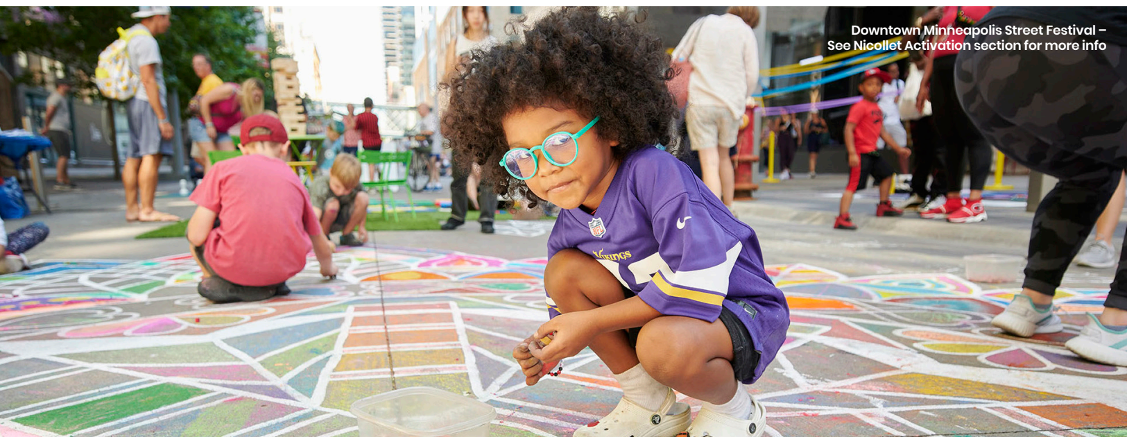
Downtown Minneapolis Street Festival – See Nicollet Activation section for more info