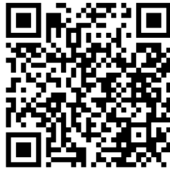
2025 Girls Registration

The same link is used for both registration and to submit your voluntary team donation. Link on our website - tesorolacrosse.org or click below.