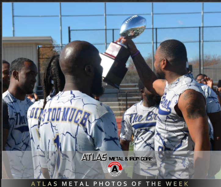
ATLAS METAL PHOTOS OF THE WEEK

With the PF3 2019 spring season just around the corner, it's time to preview what is shaping up to be an explosive season. Before we get into the previews I want to remind everyone, every player needs to sign the roster before they can play. If any players are on the suspension list, they need to fulfill the requirements before they can be reinstated. This season we will be more attentive to how teams leave their sidelines after games. If your team leaves your sidelines trashed, fines will be handed out. Please read through the rules and regulations as it is your responsibility to know them. Now with all that being said, onto the previews.