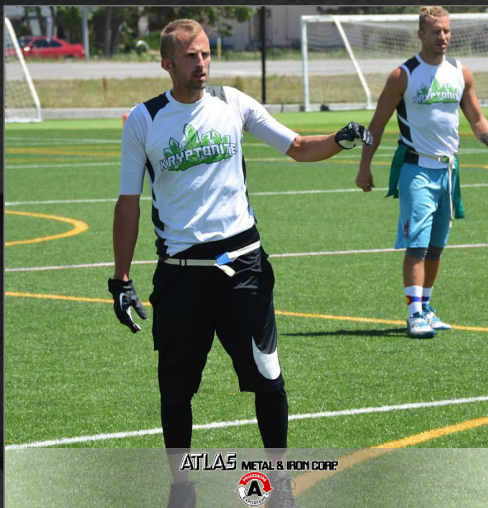
ATLAS METAL PHOTOS OF THE WEEK

This spring season we will see a group of twelve teams in the B league all vying to become the next A league team. Out of the twelve teams we only truly have one "new" new team the other eleven have played in PF3 as either a different name or a few years ago. The road to the playoffs will not be a cake walk for any team as it looks to be a very competitive season. We will have one division with the top eight making the playoffs. At least with the one division it will guarantee the top eight will battle in the playoffs. For my review of the B league I am going to separate the teams into three categories of my own opinion; the top dogs, good but decent amount of questions, and the can make playoffs but have a steep hill to climb. Without further blabbing on, a preview for your reading pleasure.