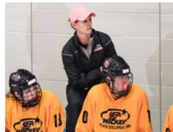
Three-time Olympian, Kacey Bellamy

While playing for a competitive collegiate program is a goal for most players who attend National Player Development Camps, USA Hockey also understands the overarching goal and dream of each player is to play for Team USA on an international level. It is important to note the average age of a player on the 2018 U.S. Women's Olympic Team was 25.9 years of age (7 years of development beyond the oldest U18 player development opportunity). Recognizing the importance of long-term athlete development is a critical component to players putting themselves in the best position to reach their goals.