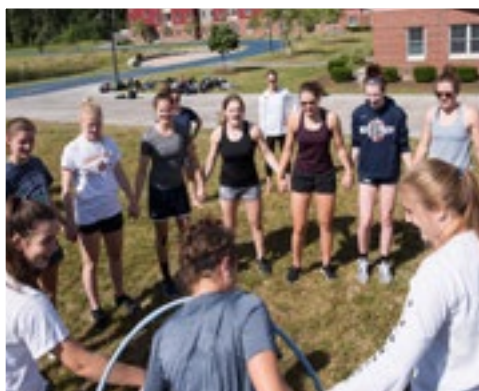
Girls at U18 Select Player Development Camp participate in team building competition

If I have been selected or named as an alternate for one of the three Girls National Player Development Camps, but I have an extenuating circumstance (emergency, injury, sickness, etc.) that prohibits or may prohibit me from attending the camp, who should I contact? A player who has been selected or named as an alternate, but has an extenuating circumstance that prohibits or may prohibit (i.e. unsure if player will be cleared from an injury), the player should notify USA Hockey's National Office and her District Girls Council Representative of the circumstances immediately.