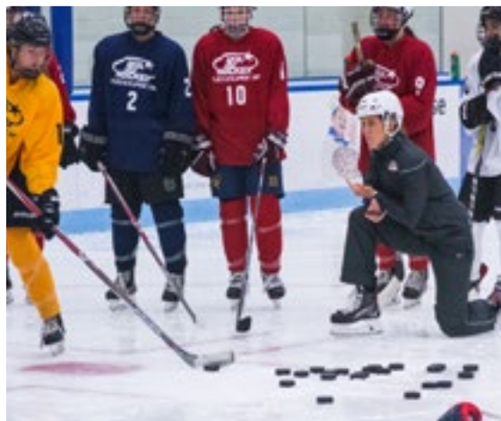
Three-time Olympian, Meghan Duggan on the ice with U18 Select Players

No. A player must have proof of her U.S. Citizenship in order to be eligible for Girls National Player Development Camps. However, some Districts may allow a non-U.S. citizen in this scenario to attend a District opportunity (tryout or camp) under the condition that she is ineligible for potential advancement to any of USA Hockey's Girls National Player Development Camps.