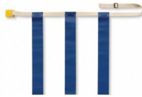
Blue Flags SKU# 1149562