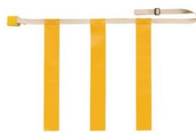
Yellow Flags SKU# 1149524