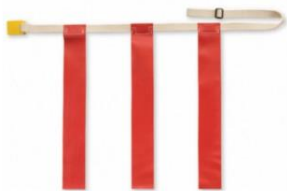
Red Flags SKU# 1149487