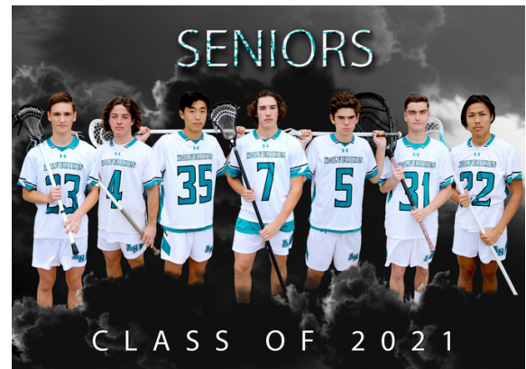
*This team photo was edited in photoshop, members' pictures taken individually

Please join us for our Senior Ceremony Thursday May 20 Immediately following Varsity Game