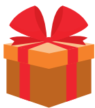
Peewee B2 Team hosted a wrapping paper drive to raise money for Sauk Rapids-Rice High School's Adopt A Family Project.