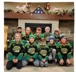
Squirt B2 Team donated needed items to Serenity Village Assisted Living facility in Avon where one of their parents works.