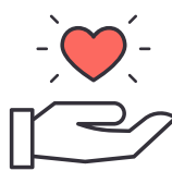
Squirt C Team adopted a team member in need and helped pay for hockey dues.

If a volunteer event was missed we apologize. Please forward your information along with pictures if you have them and we will post in the next Newsletter.