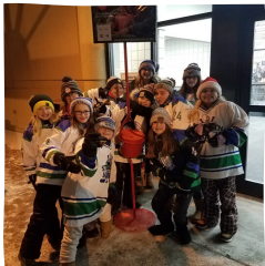
Our U10s, U12s and Mini Mites all had some fun bell ringing for the Salvation Army.