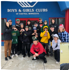
Bantam A Team DEEP cleaned Boys & Girls Club (that's where their head coach works).