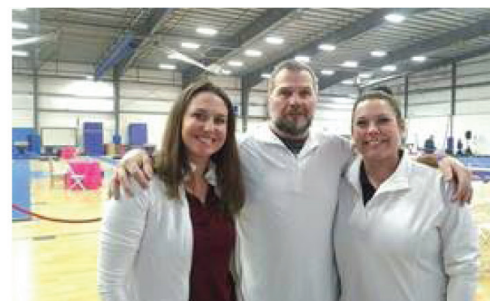
USAG ME - Maine Academy