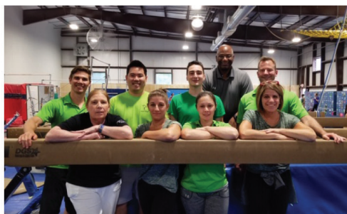
USAG RI - Aim High Gymnastics