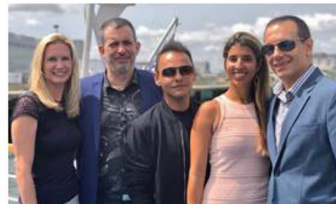
USAG NY - NYC Elite