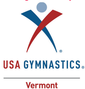
USAG VT - Northern Lights