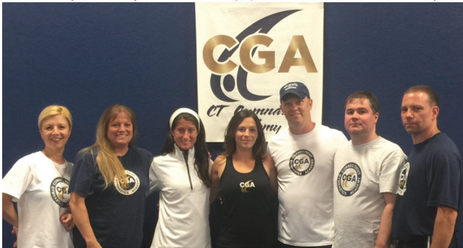
USAG Gymnastics Region 6 CT - Gymnastics Academy