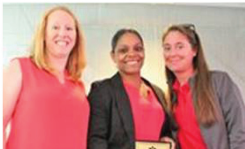
USAG NH - NH Academy Gymnastics