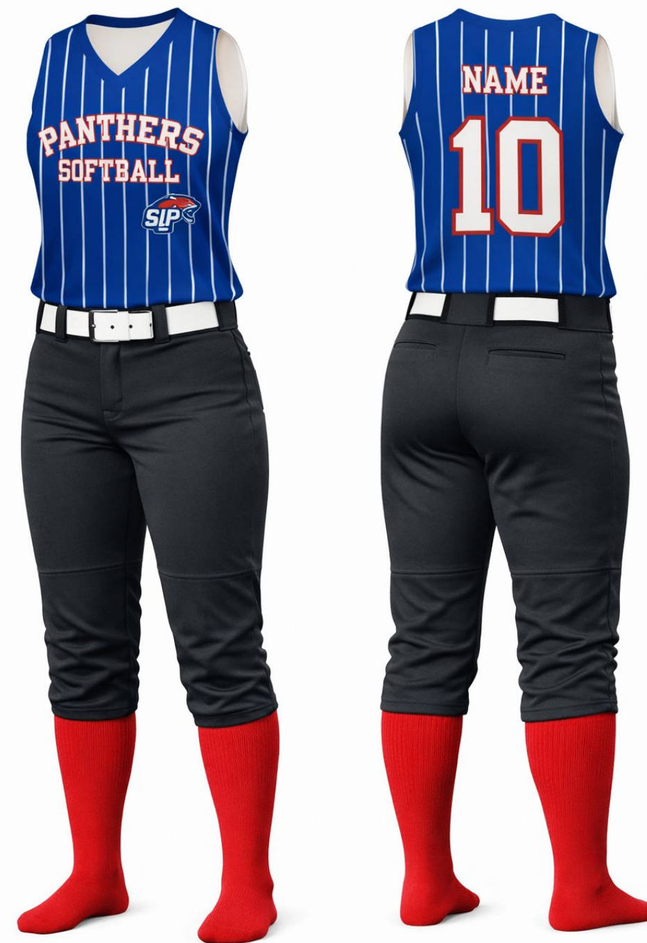
10U - 14U Full Look