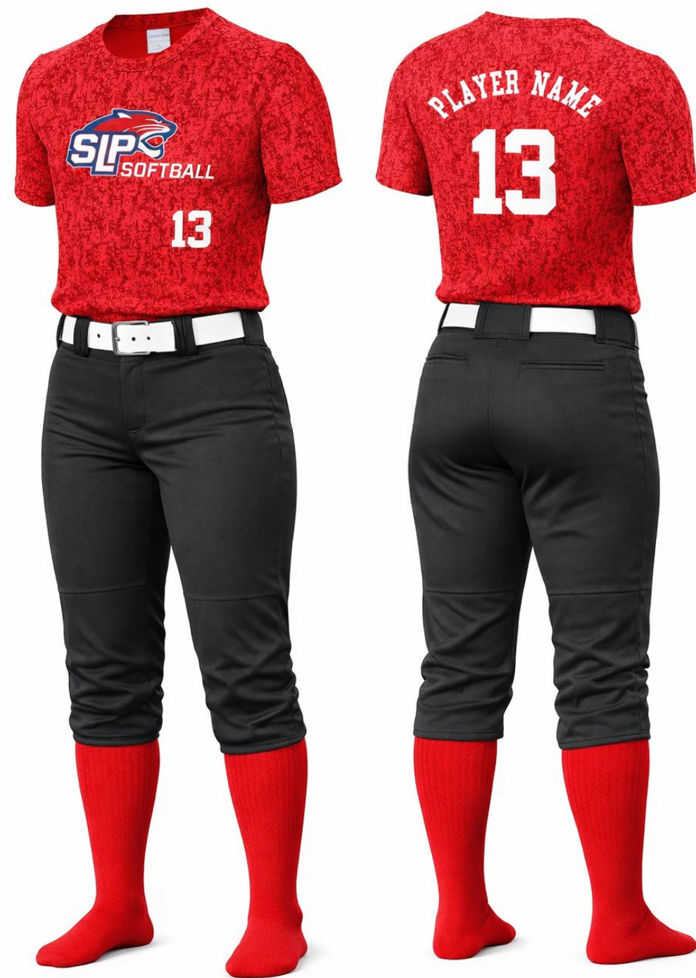
All Athletes Full Look