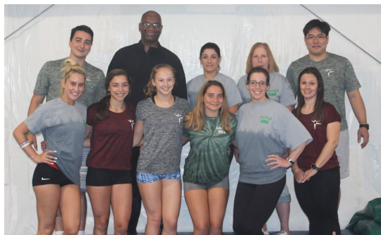
USAG RI Aim High Gymnastics