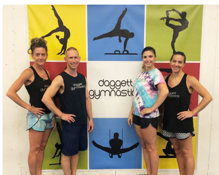
USAG MA Daggett's Gymnastics