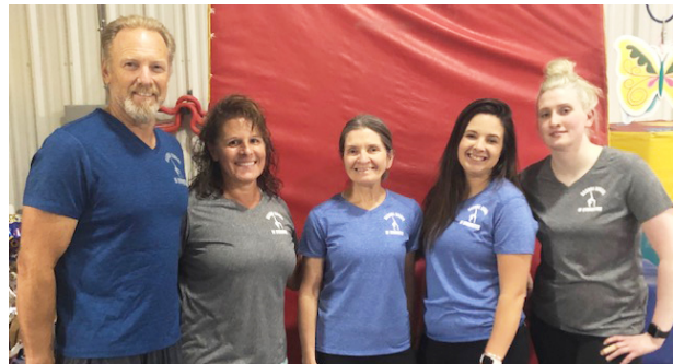
USAG NH Nashua School of Gymnastics