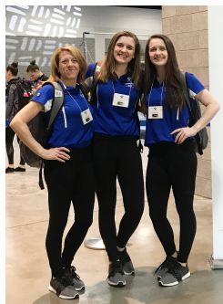
USAG VT Regal Gymnastics