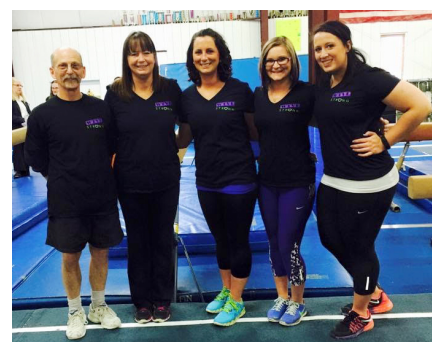
USAG ME Decal Gymnastics