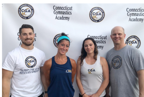
USAG CT CT Gymnastics Academy