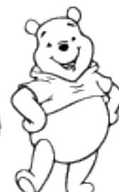
Winnie the Pooh by A.A. Milne