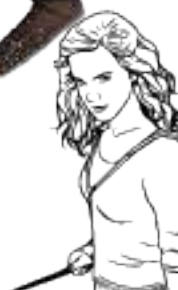
Hermione Granger, Harry Potter by J.K. Rowling

12 th Grade at New London-Spicer High School