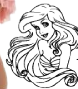
Ariel, The Little Mermaid