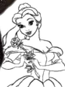
Belle, Beauty & the Beast