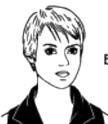
Beatrice 'Tris' Prior, Divergent by Veronica Roth