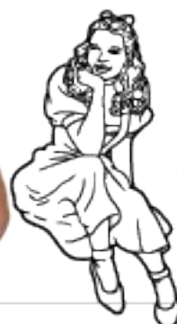
Dorothy, The Wonderful Wizard of Oz by L. Frank Baum