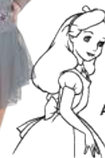
Alice, Alice in Wonderland by Lewis Carroll