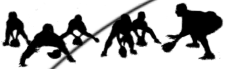
3. Infield Station