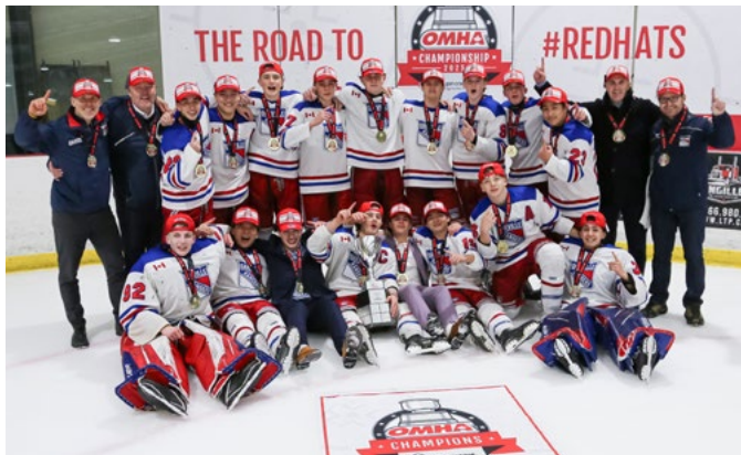
OAKVILLE RANGERS U16 AA