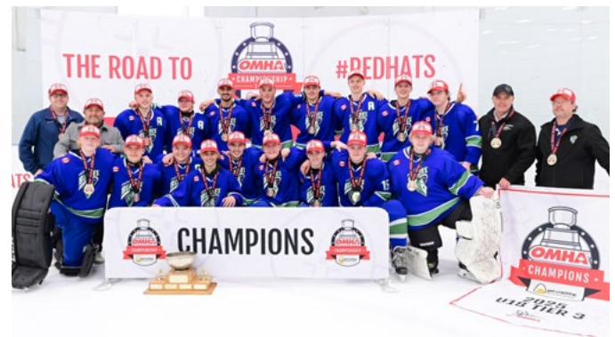
SOUTH BRUCE BLADES U18 TIER 3