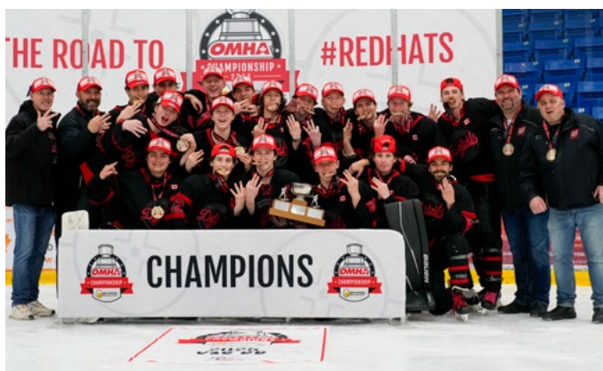
ERIN-HILLSBURGH DEVILS U18 BB