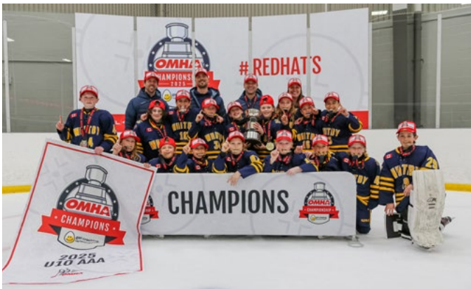
WHITBY WILDCATS U10 AAA

Congratulations to all of the Champions, Finalists, and teams who participated!