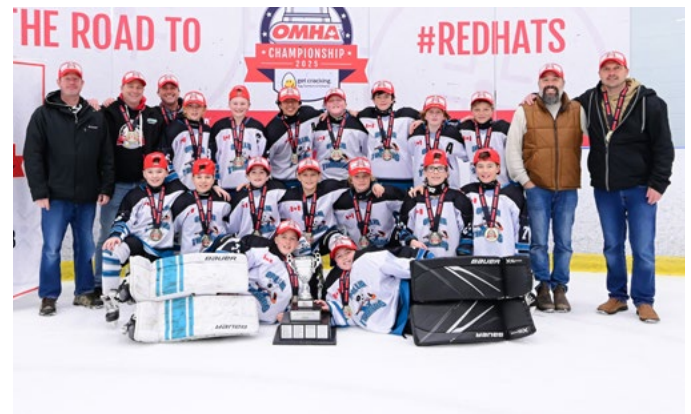
ORILLIA TERRIERS U13 TIER 3