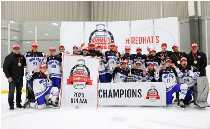
CENTRAL ONTARIO WOLVES U14 AAA