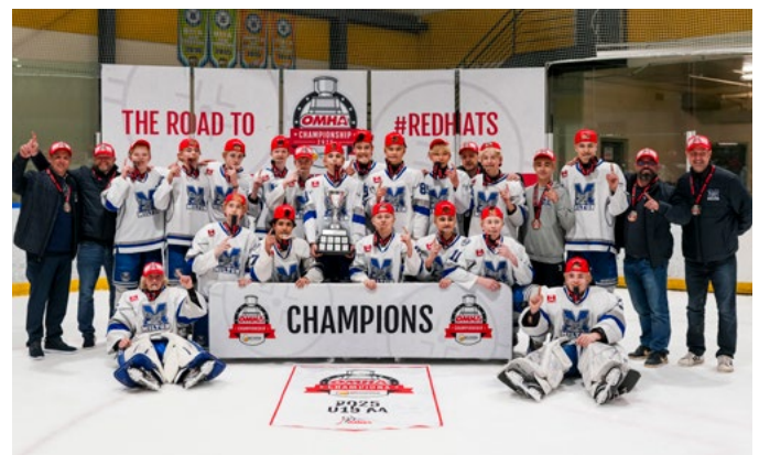
MILTON WINTERHAWKS U15 AA