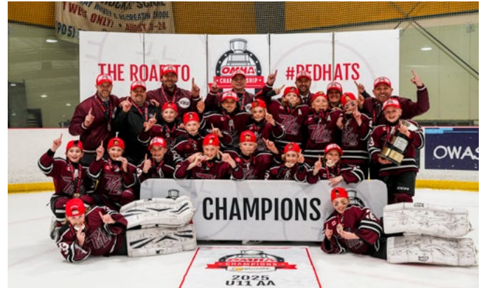
PETERBOROUGH PETES U11 AA