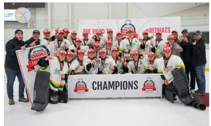
ENNISMORE EAGLES U21