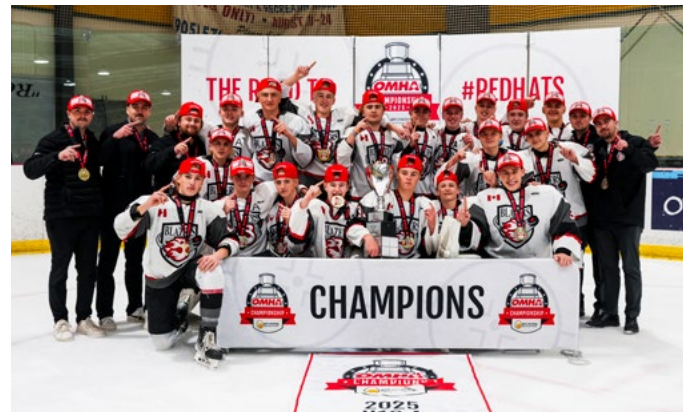
TALBOT TRAILBLAZERS U16 A