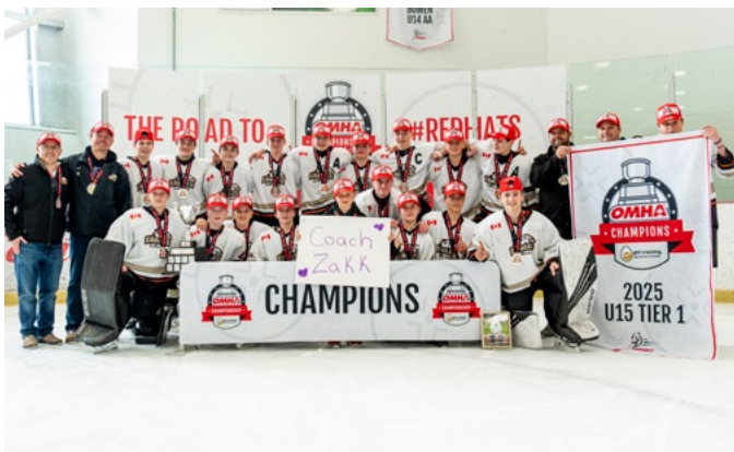
EAST LAMBTON EAGLES U15 TIER 1