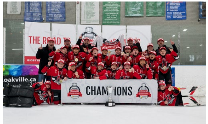
NEWMARKET RENEGADES U12 B