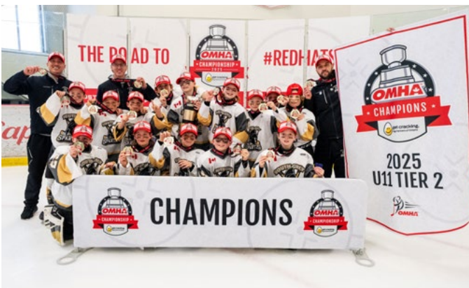
SOUTH GREY SPARTANS U11 TIER 2