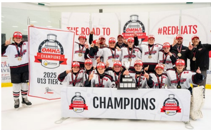
STURGEON LAKE THUNDER U13 TIER 2