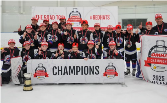
SOUTHERN TIER ADMIRALS U11 AAA