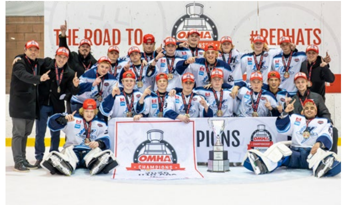
HALTON HURRICANES U16 AAA