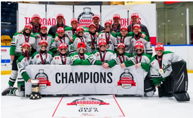
ST. THOMAS STARS U12 A