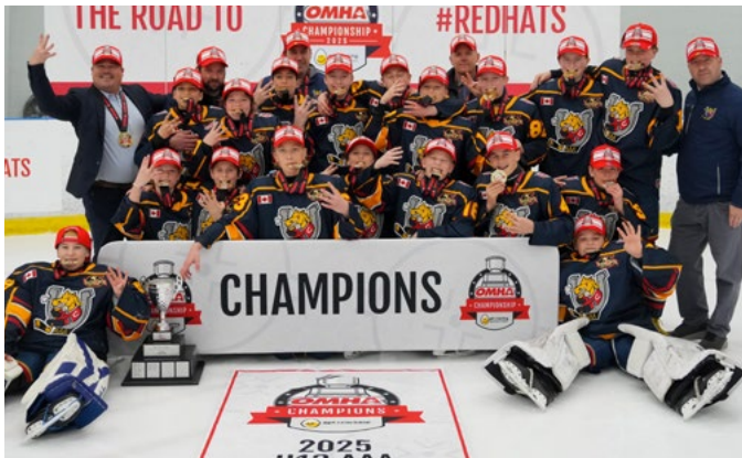
BARRIE JR. COLTS U13 AAA