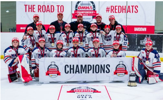
WOOLWICH WILDCATS U11 A