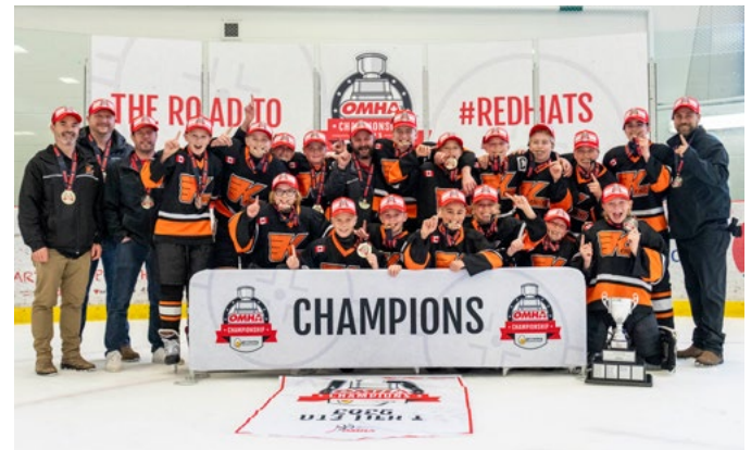
KINCARDINE KINUCKS U13 TIER 1