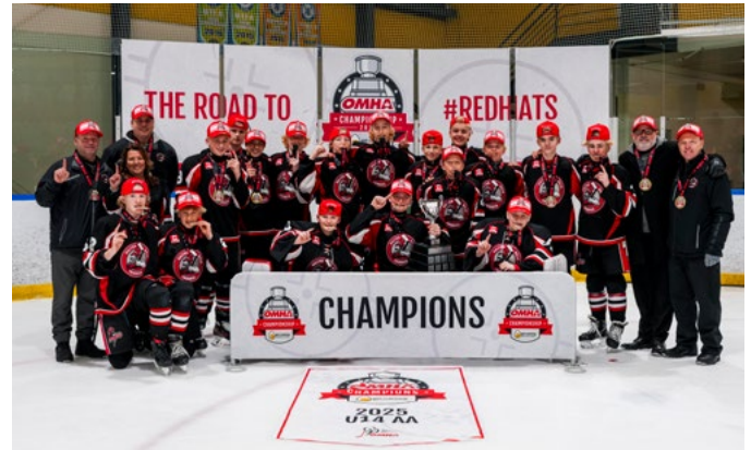
HALTON HILLS THUNDER U14 AA