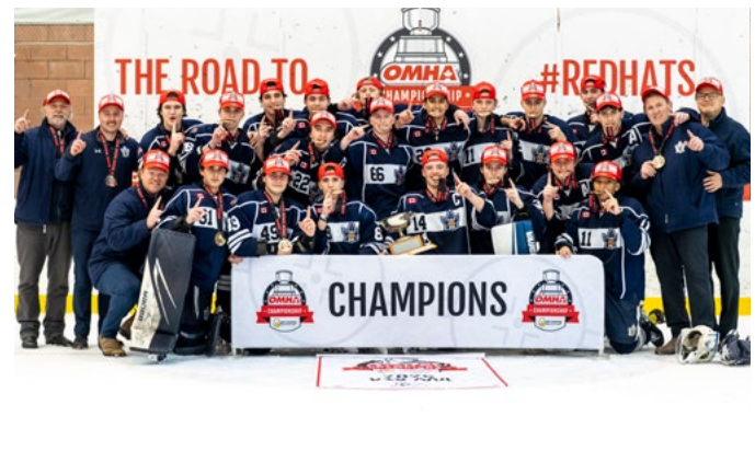
MARKHAM WAXERS U18 AAA