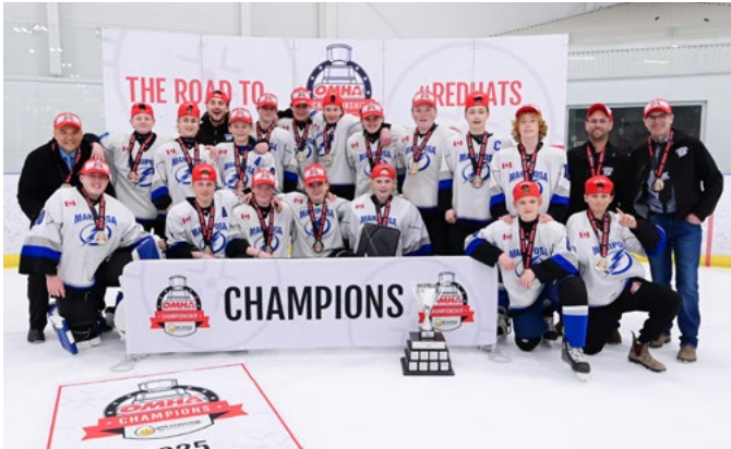
MARIPOSA LIGHTNING U15 TIER 3