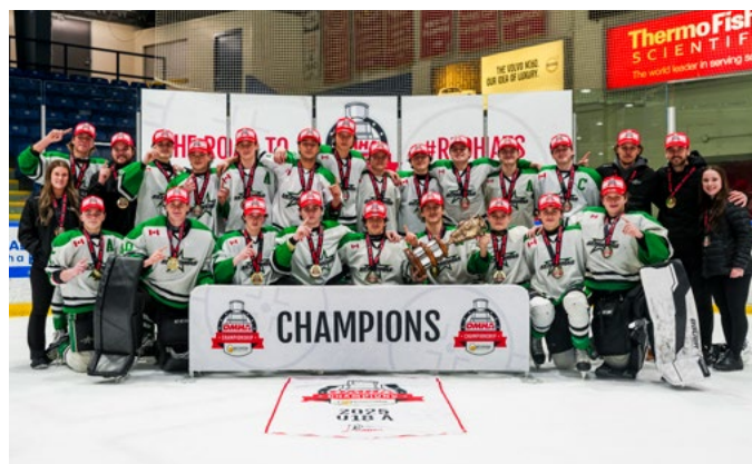
ST. THOMAS STARS U18 A