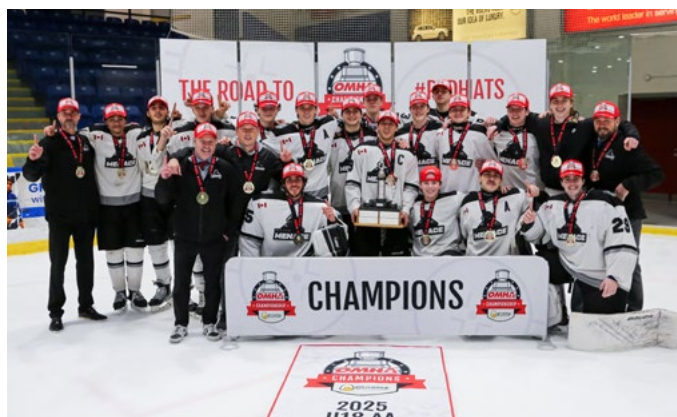
MILTON JR. MENACE U18 AA