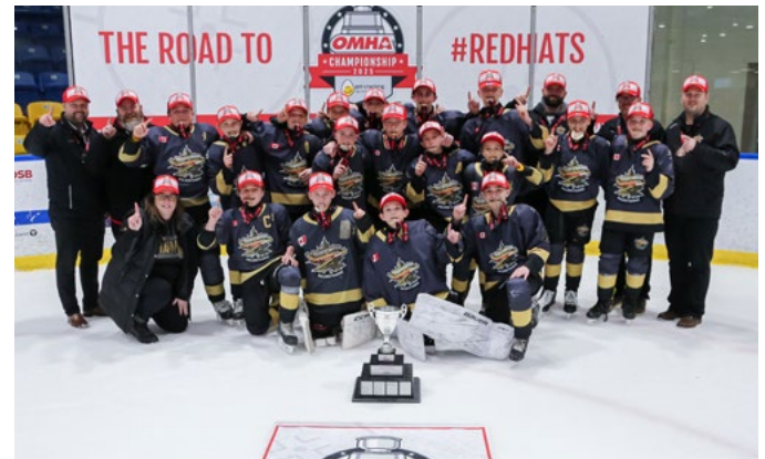
QUINTE WEST GOLDEN HAWKS U13 AA