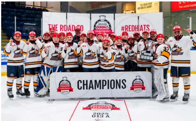
BURLINGTON EAGLES - GOLD U13 A