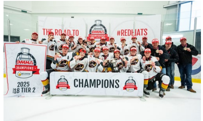
HURON-BRUCE BLIZZARD U18 TIER 2