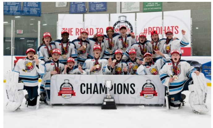
BARRIE JR. COLTS U14 BB