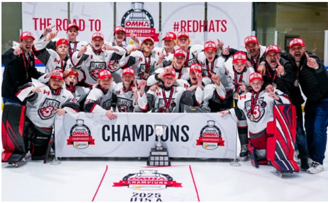
TALBOT TRAILBLAZERS U15 A