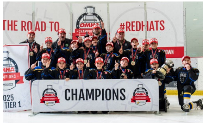
MID-HURON HUSKIES TIER 1