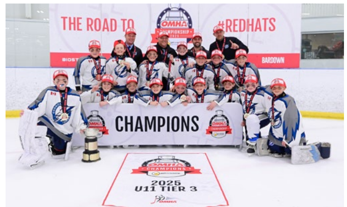
GEORGIAN SHORES LIGHTNING U11 TIER 3