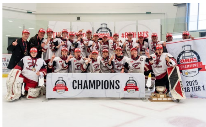
KAWARTHA COYOTES U18 TIER 1