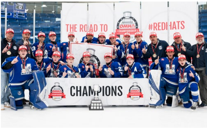
MILTON WINTERHAWKS - WHITE U15 BB