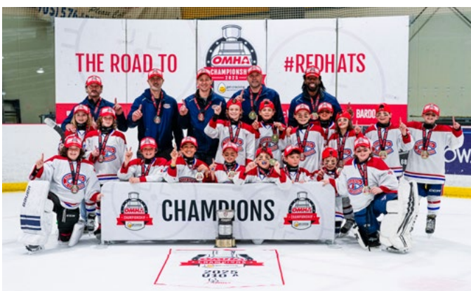
BELLE RIVER CANADIENS U10 A