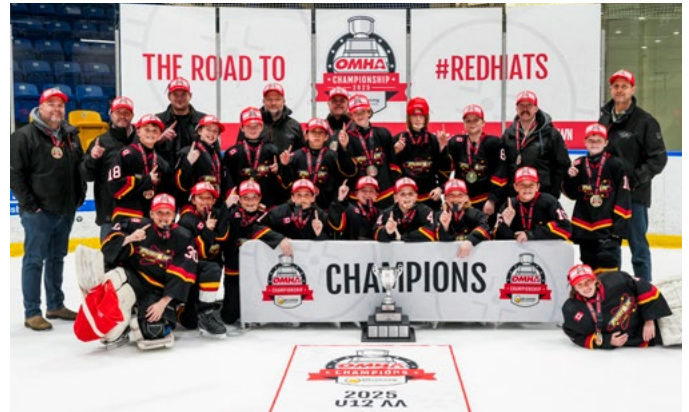
CENTRE WELLINGTON FUSION U12 AA