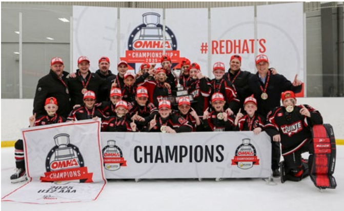
QUINTE RED DEVILS U12 AAA