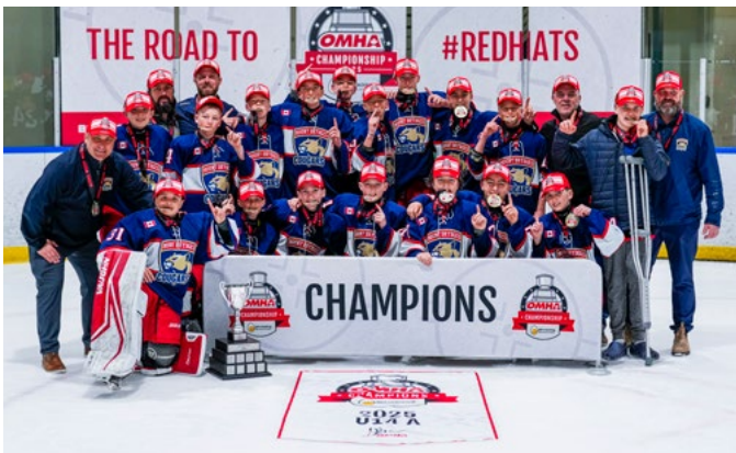
MOUNT BRYDGES COUGARS U14 A