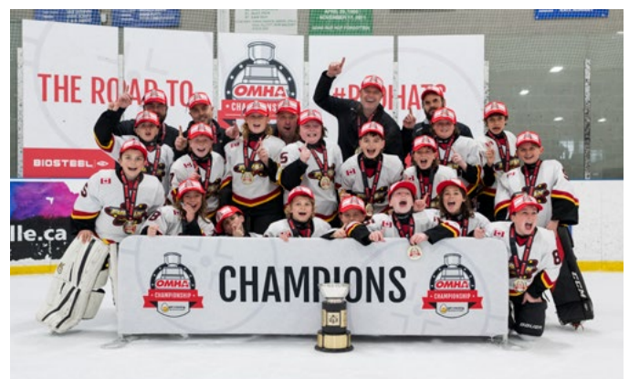
CENTRE WELLINGTON FUSION U10 B