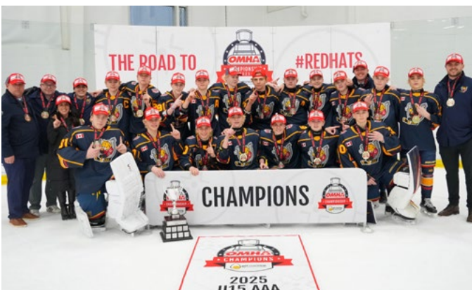
BARRIE JR. COLTS U15 AAA