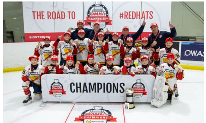
TNT TORNADOS U10 AA