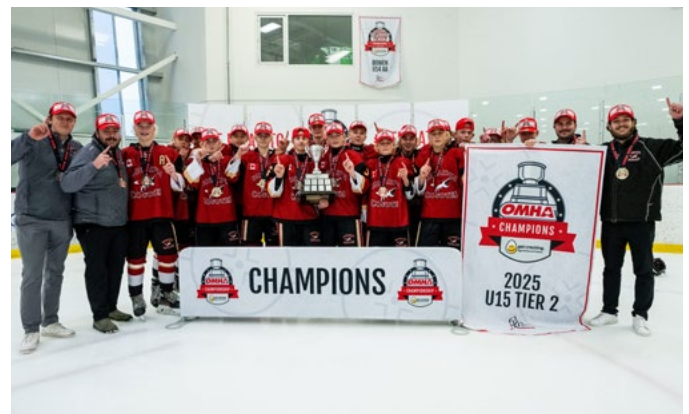
KAWARTHA COYOTES U15 TIER 2