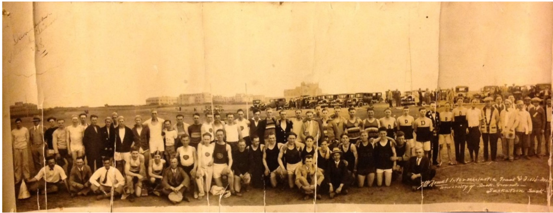
Merit Reunion 1989