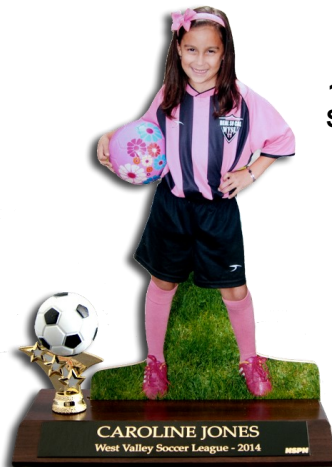
11 - JUMBO STATUETTE hand-cut keepsake includes nameplate and sports figure