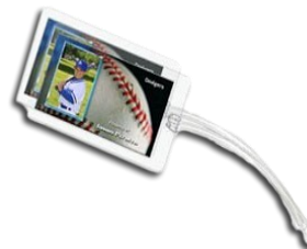
29 - BAG TAGS (SET OF 2) feature player's name, team name and year