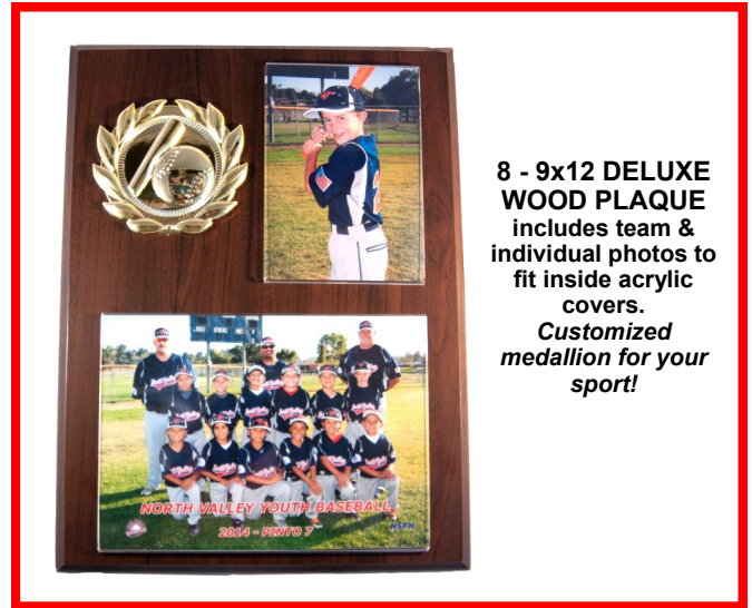
8 - 9x12 DELUXE WOOD PLAQUE includes team & individual photos to fit inside acrylic covers. Customized medallion for your sport!