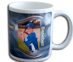
23 - CERAMIC PHOTO MUG features player's name, team, sport & year