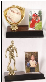
10 - DESK FRAME holds your wallet photo & includes gold sports figure (glove for baseball/ softball - does not include ball)