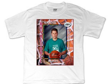
30 - PHOTO T-SHIRT features player's name, team, sport & year (adult sizes only)