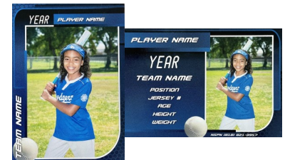
21 - TRADING CARDS (SET OF 16) double-sided cards feature player's stats and customized with template for your sport! Must fill out Trader Card Data box on front of form.