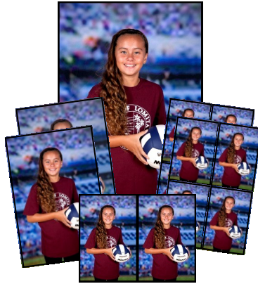
5 - JUST INDIVIDUAL PHOTOS includes 1 - 8x10, 2 - 5x7, 2 - 3½x5 & 4 wallets