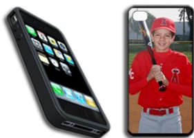
26 - CELL PHONE CASE Only iPhone & Samsung Galaxy "S" series cases available. Specify brand & model on front of form