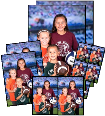
4 - JUST BUDDY/ FAMILY PHOTOS (2 or more people in photo) includes 2 - 8x10, 2 - 5x7, 2 - 3½x5 & 4 wallets

PRODUCTS WILL BE CUSTOMIZED TO YOUR SPORT. DIGITAL DESIGN MAY VARY FROM SAMPLES BELOW.