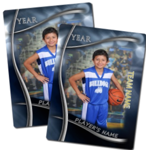
22 - PHOTO MAGNETS (SET OF 2) feature player's name, team, sport & year