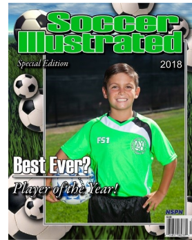
16 - 8x10 MAGAZINE COVER PHOTO customized with template for your sport