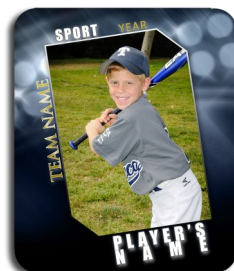
27 - MOUSE PAD features player's name, team, sport & year