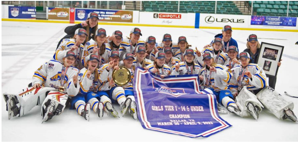
2023 U14 Tier 1 Girls USA Hockey National Champions