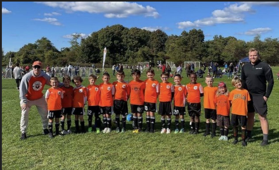
U9 boys teams played the East Islip Fall Classic and won 2nd Place!