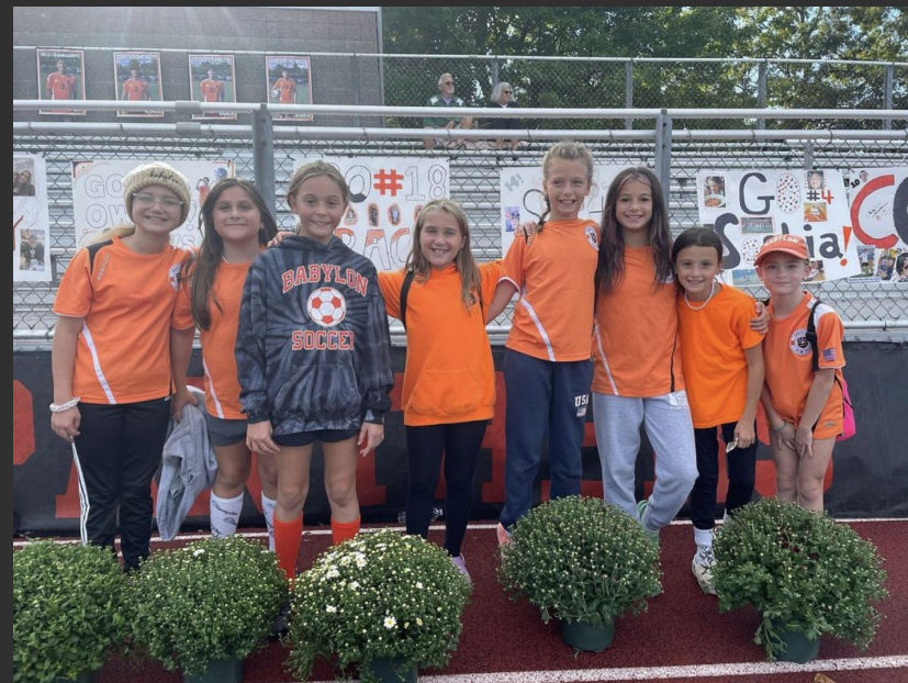
U11 Teams Volunteer at Soccer Under the Lights!