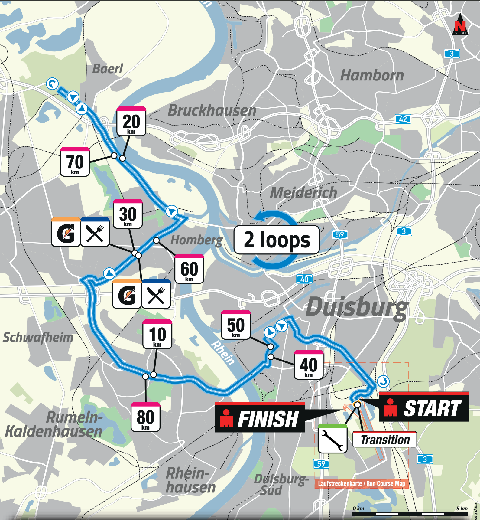
90 km - 120 Höhenmeter / altitude difference