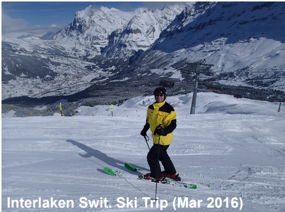
Interlaken Swit. Ski Trip (Mar 2016)

Our focus continues with its original mission of helping everyone enjoy the sport of skiing. We are an adult club (age 21 and older) that focuses on year-round activities for all ages including family functions.