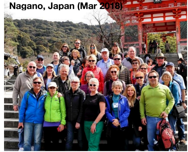
Nagano, Japan (Mar 2018)

P. O. Box 6015 Boise, Idaho 83707 BogusBasinSkiClub.org