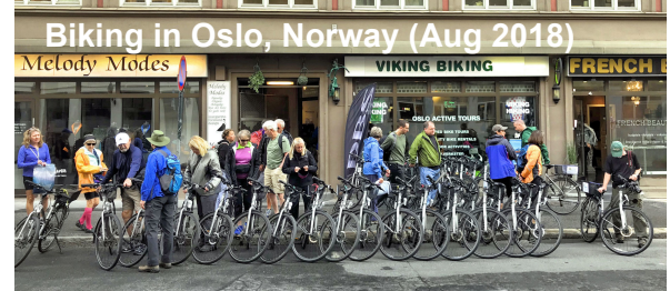
Biking in Oslo, Norway (Aug 2018)