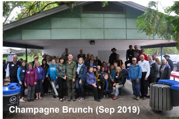
Champagne Brunch (Sep 2019)