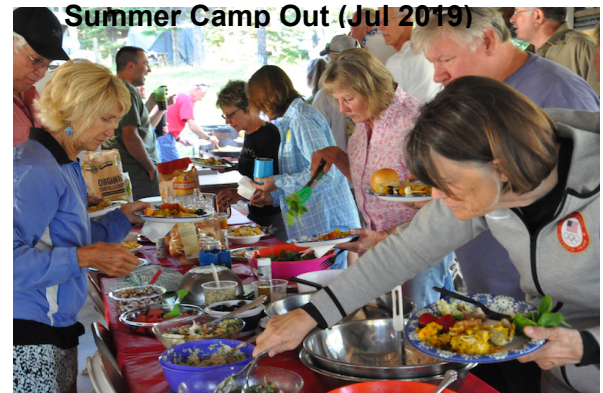
Summer Camp Out (Jul 2019)

The Bogus Basin Ski Club is a volunteer organization that sponsors year-round outdoor recreation activities for its members. The club is a 501 (c) (7) non-profit social organization that uses its funding to sponsor activities fostering enthusiasm for snow sports in our community.