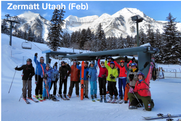
Zermatt Utaah (Feb)