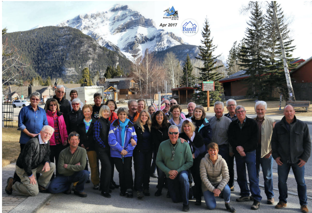
Apr 2017 Banff