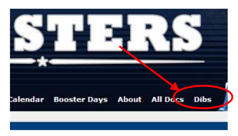
Step 3: Choose your Session

Once you are logged in, click on Dibs tabs on the far right of the home page.