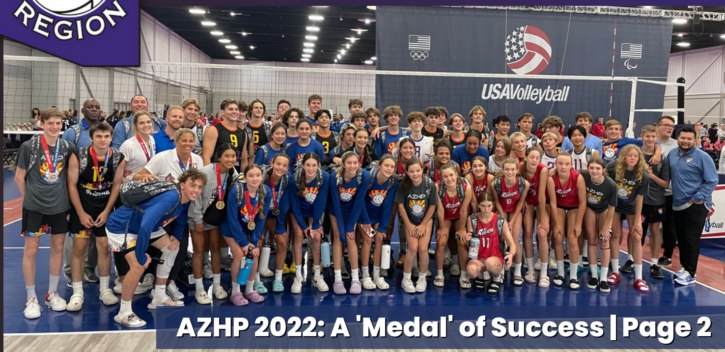
AZHP 2022: A 'Medal' of Success | Page 2