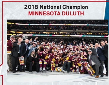
2018 National Champion MINNESOTA DULUTH

NCHC teams have qualified for the NCAA Tournament, second-most from one conference since 2013, including an NCAA Tournament record 75 percent of NCHC teams (six of eight) in 2015.