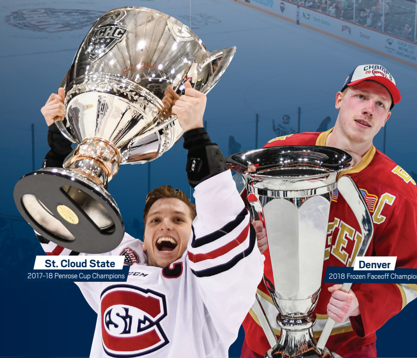
St. Cloud State 2017-18 Penrose Cup Champions