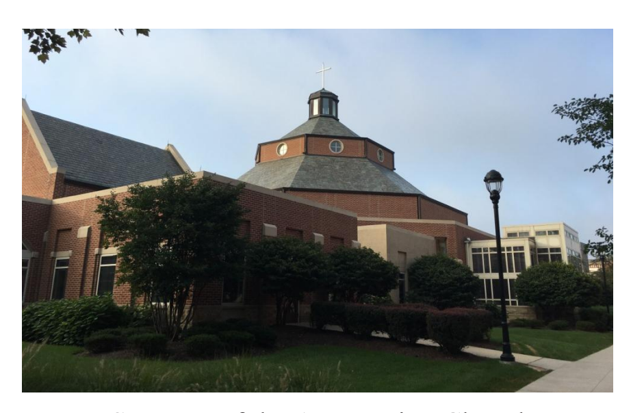
St. Mary of the Assumption Chapel

Years in passing cannot sever Ties of new days from the old. We're Ignatius men forever As we hail the blue and gold.