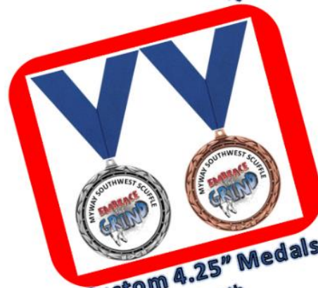
Custom 4.25" Medals 2nd-4th All Divisions