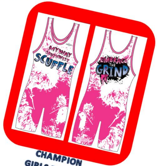
CHAMPION GIRLS DIVISION