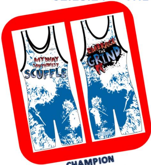
CHAMPION OPEN DIVISION