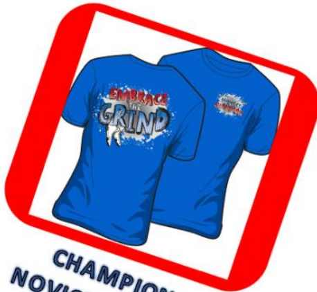
CHAMPION NOVICE DIVISION