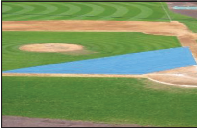
Infield Protective Mat

Do not use equipment that appears to be worn or damaged. Please report damaged equipment to the District Supervisor.