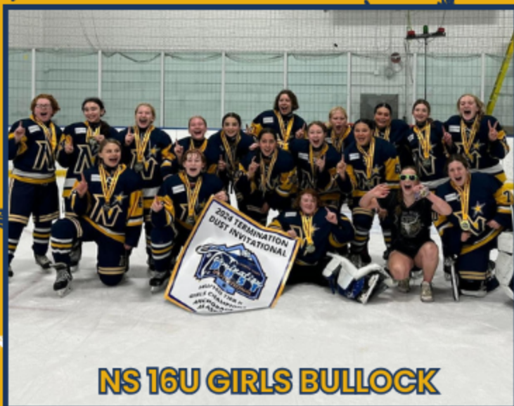
NS 16U GIRLS BULLOCK