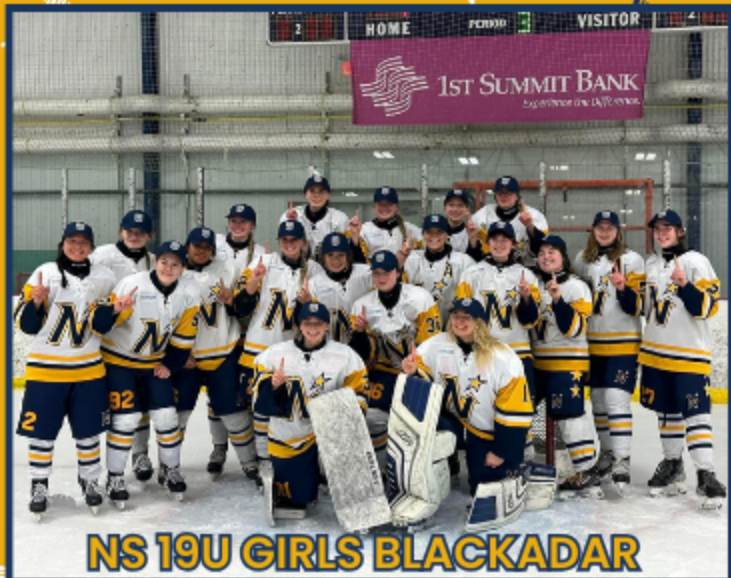
NS 19U GIRLS BLACKADAR