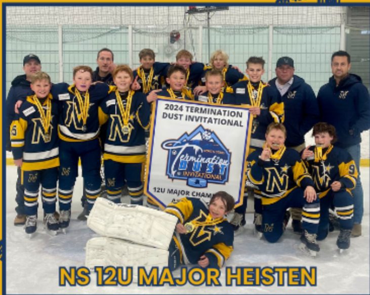
NS 12U MAJOR HEISTEN