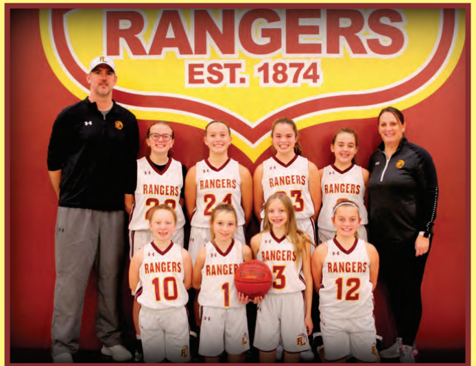
6th Grade Maroon