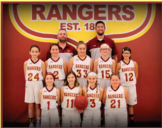
5th Grade Maroon