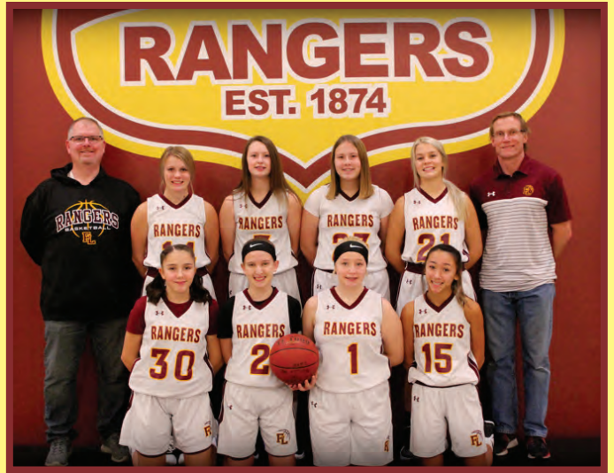
8th Grade Gold