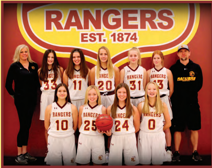
8th Grade Maroon