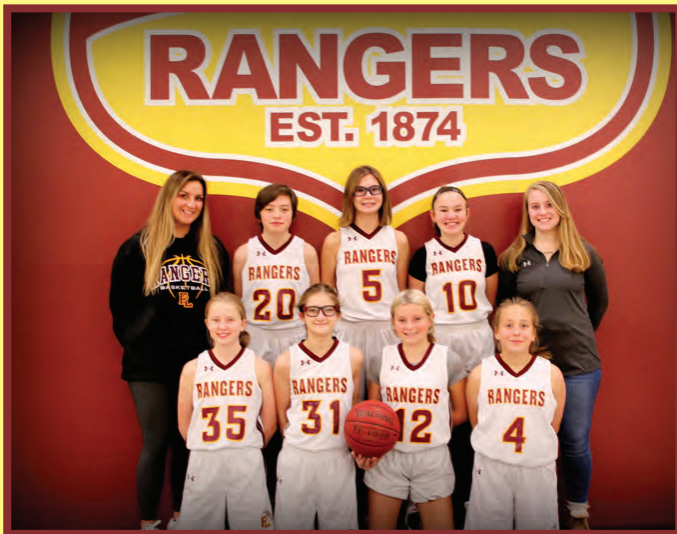
7th Grade Maroon