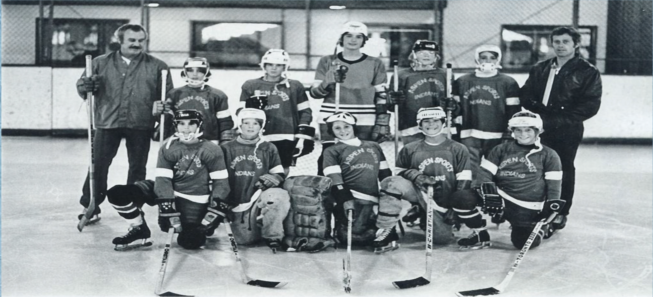
AJH first Pee Wee team 1972