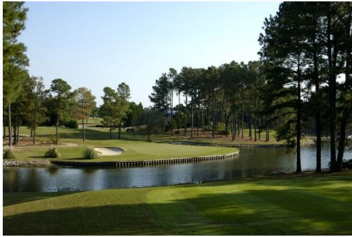
Reedy Creek Golf Course